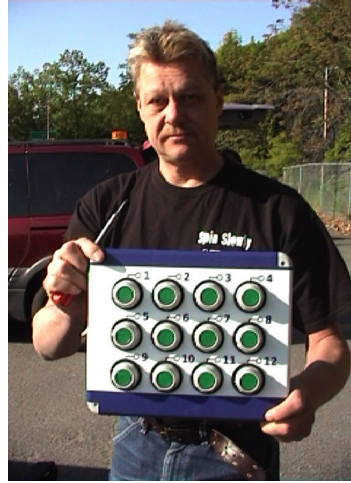
The outside lid of the switchbox.