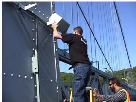
Mounting the speakers.