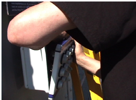
Attaching the switchbox lid.