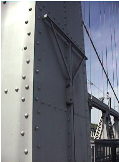
Frame work for the Listening Station.