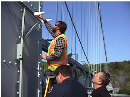
Mounting the speaker hardware.