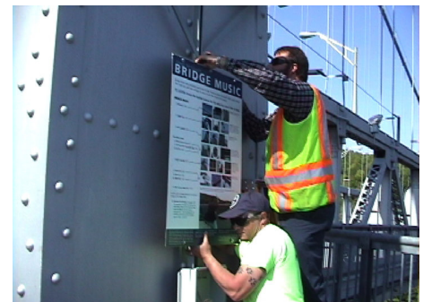
Mounting the signs.