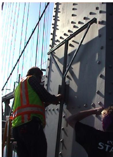
Threading of speaker wire.