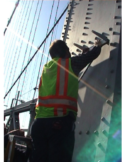
Mounting the speaker hardware.