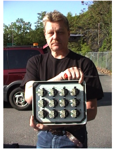
The inside lid of the switchbox.