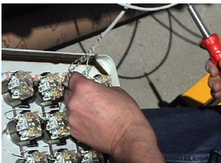
Connecting switchbox to the playback unit.