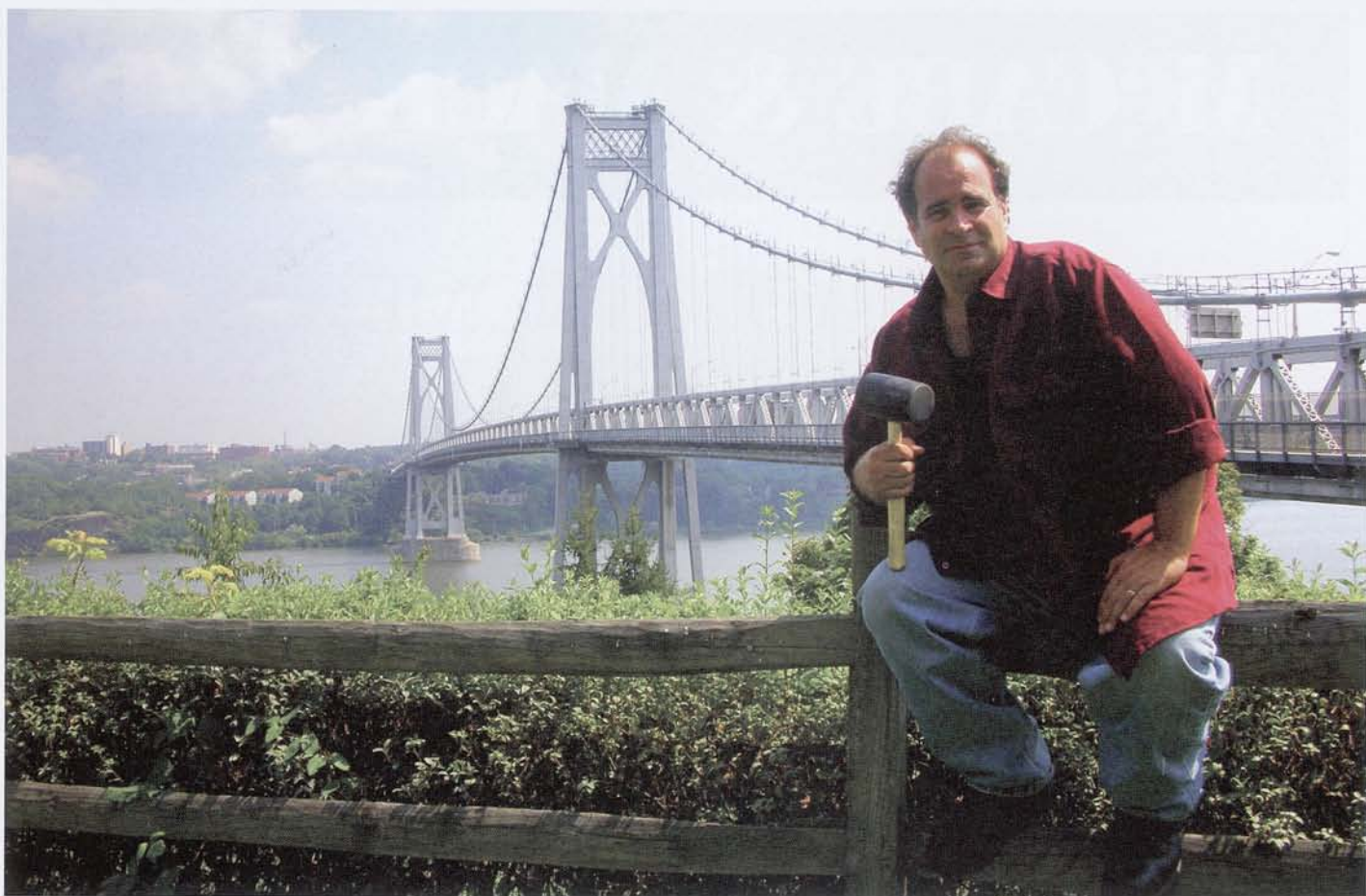
A MAN WITH A MISSION.