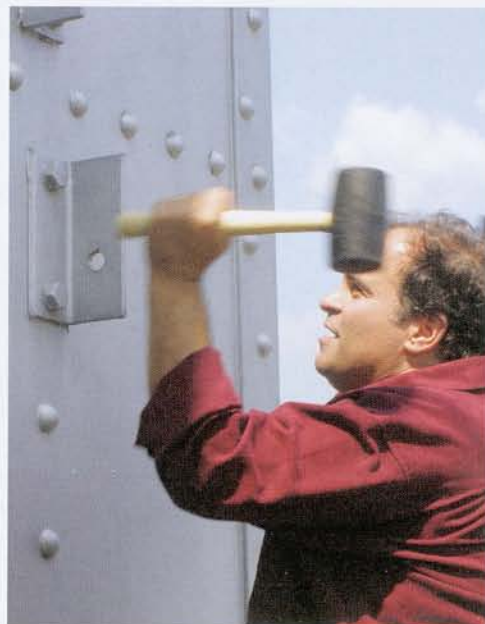
GETTING THE RIGHT TONE FROM THE STEEL TOWER.